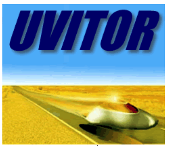
The SkyCar: A concept 4<sup>th</sup>-dimensional propulsion system by Shipov's company.

AAG: Physics, and especially relativity theory, handle the concepts of rotation, angular-momentum, and spin very differently than the idea of linear momentum. I'd say that most