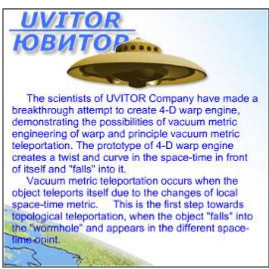
UVITOR Corp: Shipov's startup-company is dedicated to a true Antigravity breakthrough.

AAG: What are your thoughts about the homogenous physical vacuum versus the inhomogeneous physical vacuum per Dylatov formerly of Novosibirsk? As I understand the difference, the homogenous model suggests that all particles have a gravitic, electromagnetic, and spinfield and are evenly distributed throughout the domain but the inhomogeneous model maintains that differences in these fields occur across boundaries that are defined by anomalies. What does this mean to Torsion research?